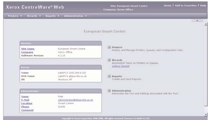
Xerox CentreWare Web is web based software that installs, configures, manages, monitors and reports on the networked printers and multifunction devices throughout the enterprise – regardless of the manufacturer.

For small offices who have little or no IT support, new multifunction system systems must be easy to setup and deploy. The WorkCentre 4118 is simple to connect directly to a PC or Mac via USB or parallel and installing the drivers and management software is easy with the included installation and setup CD. WorkCentre 4118 multifunction systems with the network kit easily integrate into your network and are also easily installed to client PCs with the included driver installation CD.