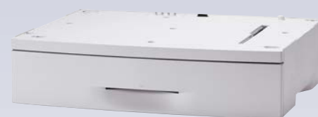
Additional 550-sheet Paper Tray