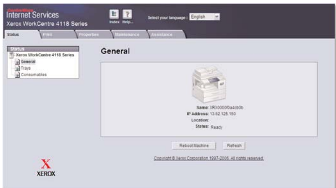
CentreWare Internet Services is a web server embedded in every WorkCentre product. You can submit and monitor print jobs and machine status from anywhere – from your intranet to the World Wide Web.

Xerox CentreWare® Web management software is a powerful enterprise-level management solution. CentreWare Web is optional, free software that eases the chore of installing, configuring, managing, monitoring and pulling reports from the networked printers and multifunction systems through the enterprise – regardless of vendor.